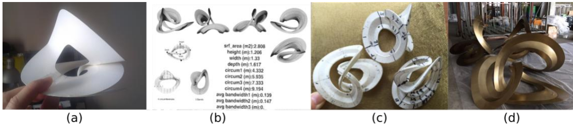
Figure 3: (a) paper models (b) translated parametric 3D model (c) 3D printed scaled models (d) fabricated sculptures

We mapped the design process and decided to assess three computational technologies that could have improved the design process. They are web-based interactive parametric modeling using OpenJSCad (OpenJSCAD, 2022), Matter and Form V2 table top 3D Scanner (Matter and Form, 2022) and Leica BLK360 Terrestrial LiDAR Scanner (TLS) (Leica, 2022). Table 7 maps the design process and data flows with the design technologies under assessment.