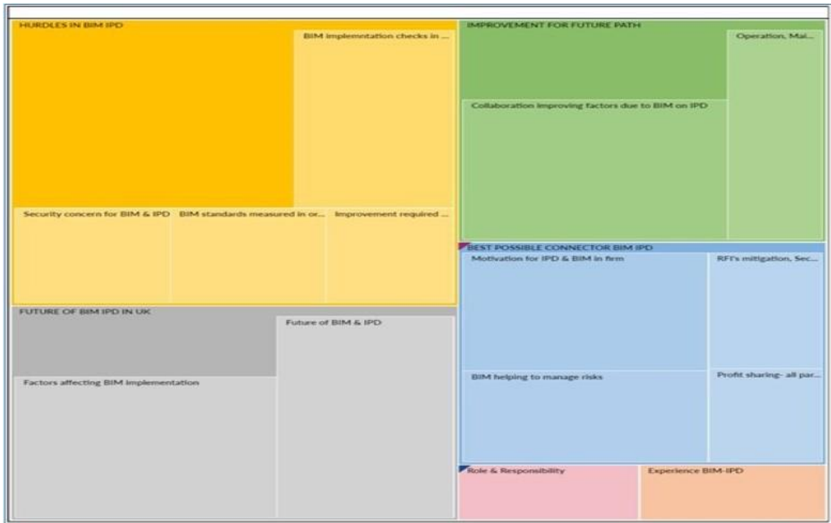
FIG. 3 Thematic hierarchy chart using NVivo 12 software, from the analysis